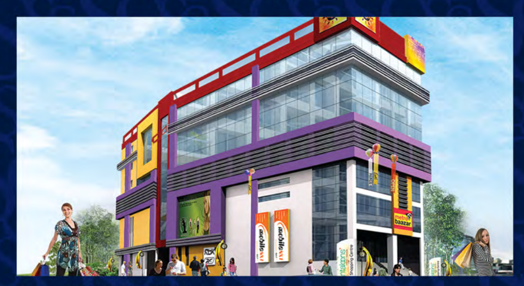
Aitorma, AGARTALA, TRIPURA