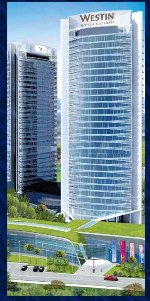
Westin Hotel & V Apartments - KOLKATA, W.B.