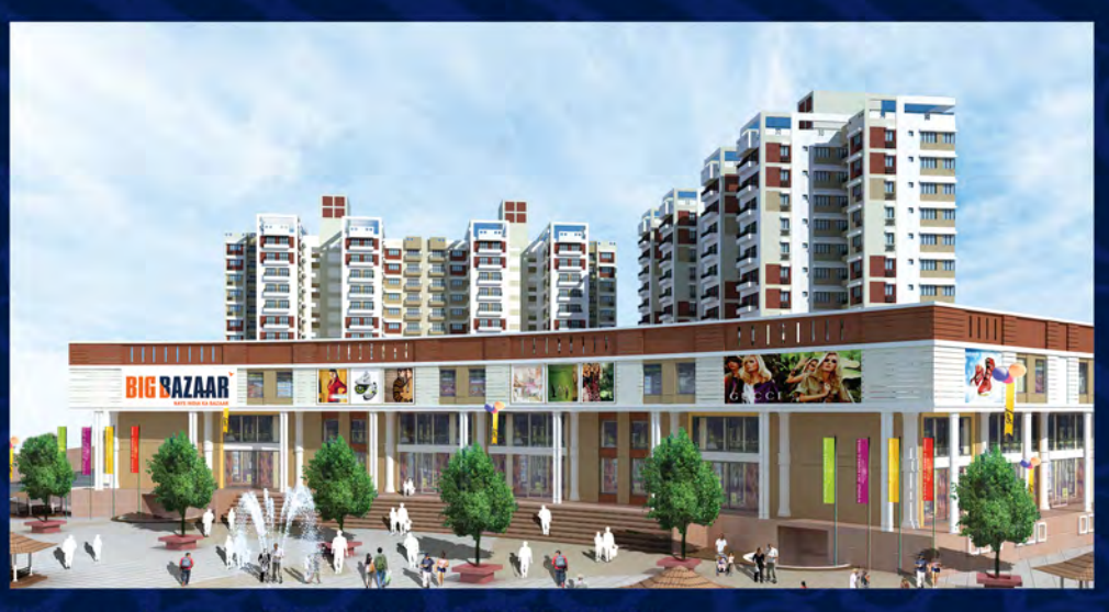
Krishnagar Sentrum, KRISHNANAGAR, WEST BENGAL