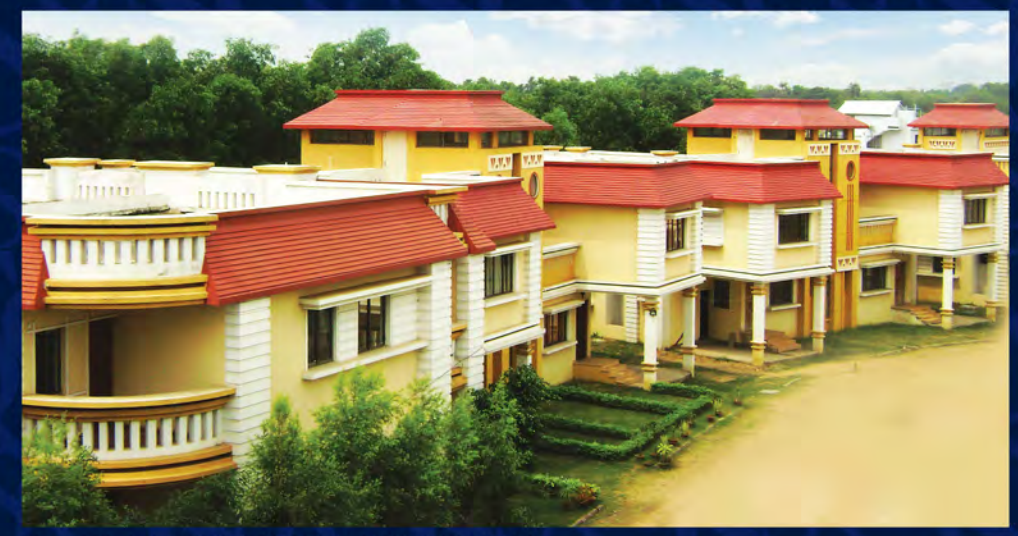
Shanti Shristi, SANTINIKETAN, WEST BENGAL