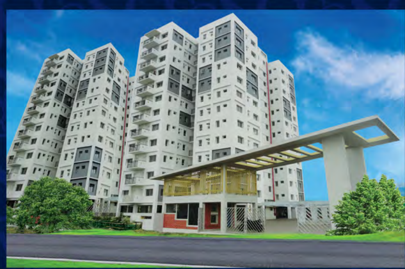
The Arena, HALDIA, WEST BENGAL