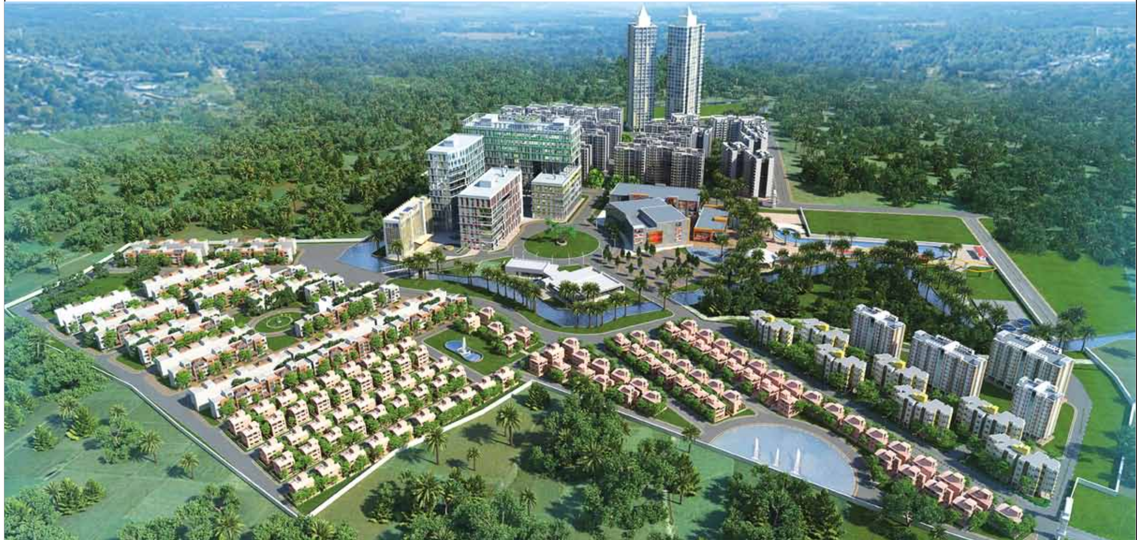
SHRISTINAGAR - ASANSOL | INTEGRATED TOWNSHIP