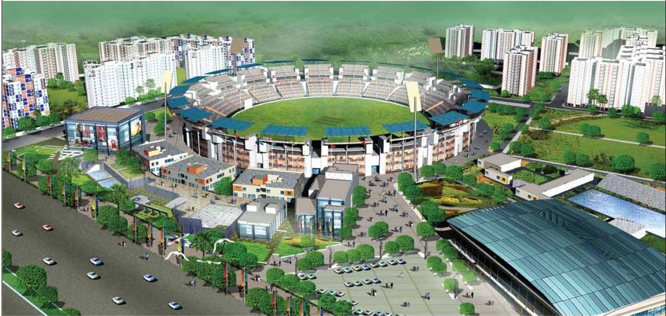
THE ARENA - HALDIA INTERNATIONAL SPORTS CITY | INTEGRATED TOWNSHIP