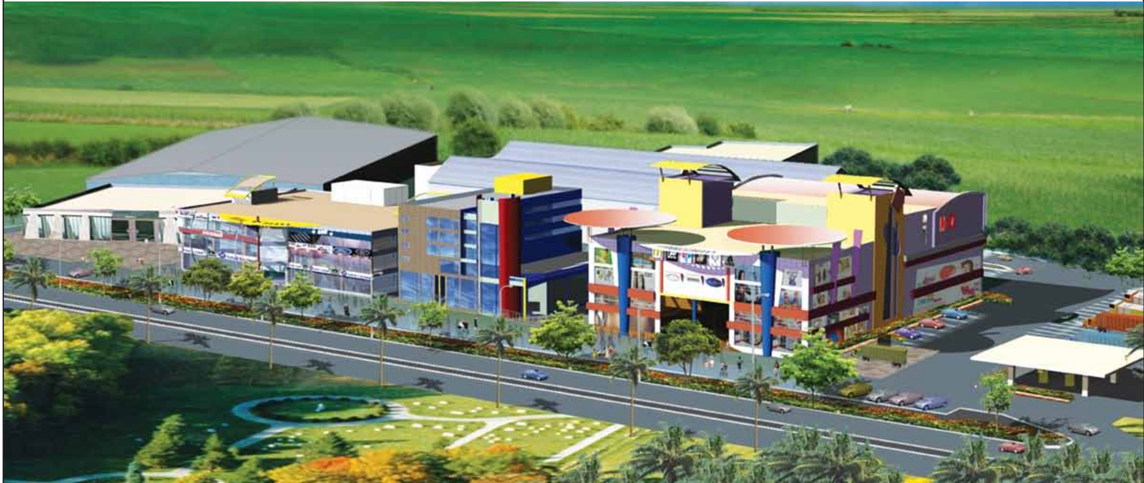
RANIGANJ SQUARE - THE HIGHWAY HUB | LOGISTICS HUB