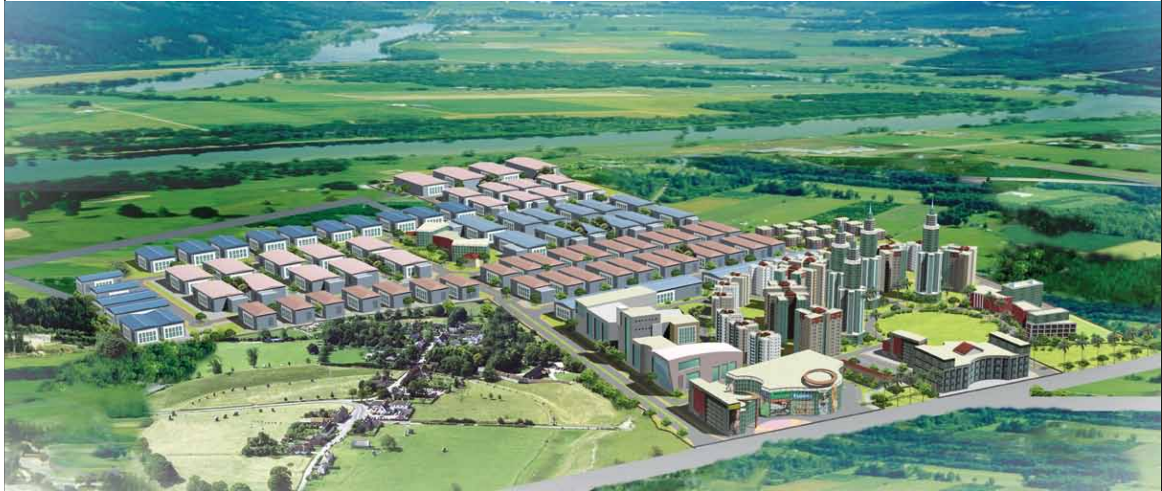
KANCHAN JANGA INTEGRATED PARK, SILIGURI | INTEGRATED INDUSTRIAL HUB