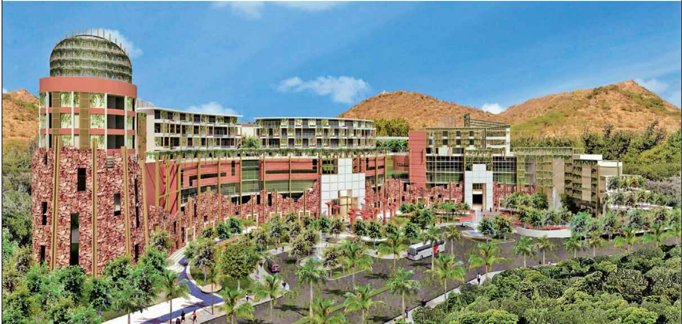
5 STAR HOTEL & THE V, UDAIPUR, RAJASTHAN | HOSPITALITY & MIXED USE