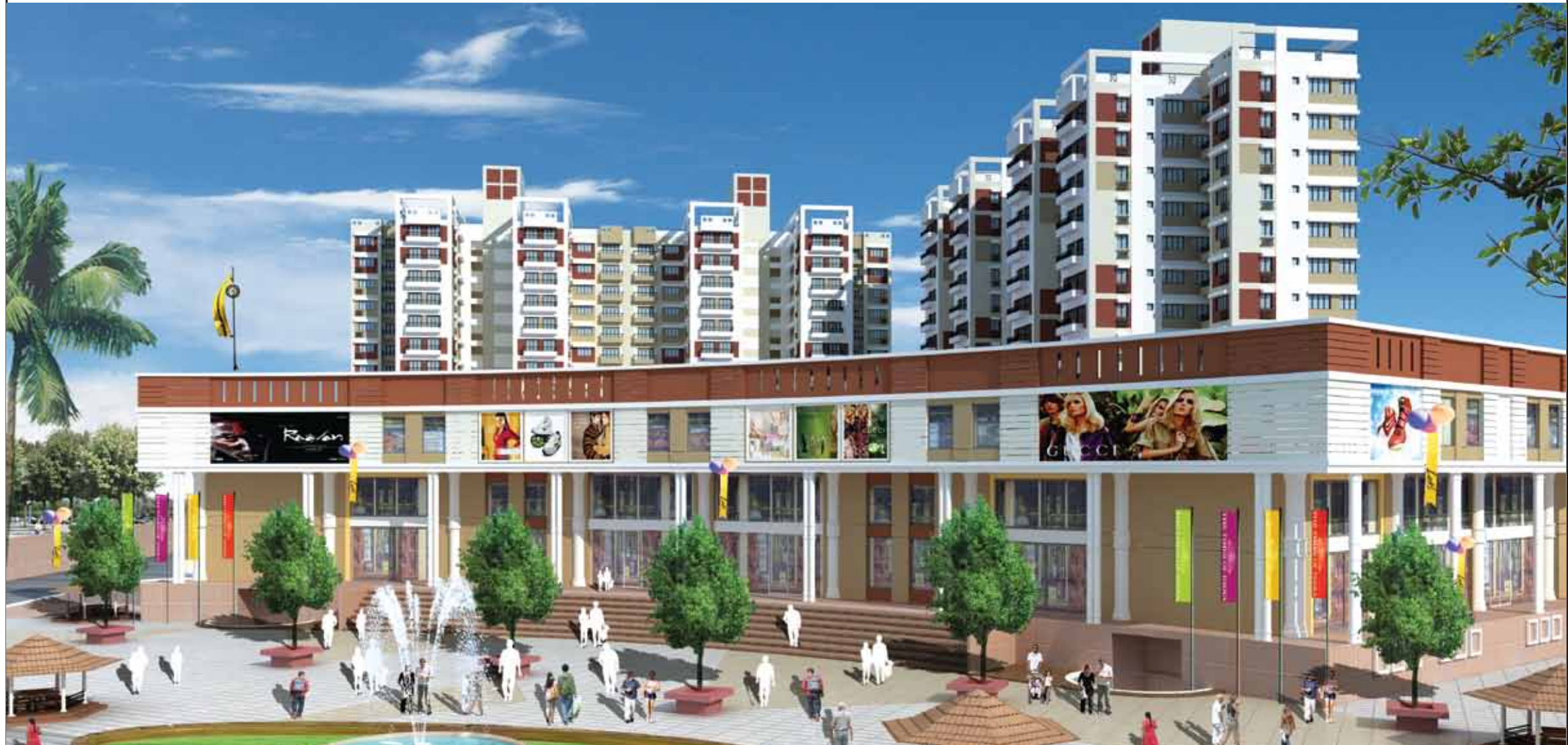
KRISHNAGAR SENTRUM | COMMERCIAL & RESIDENTIAL COMPLEX WITH RETAIL MALL