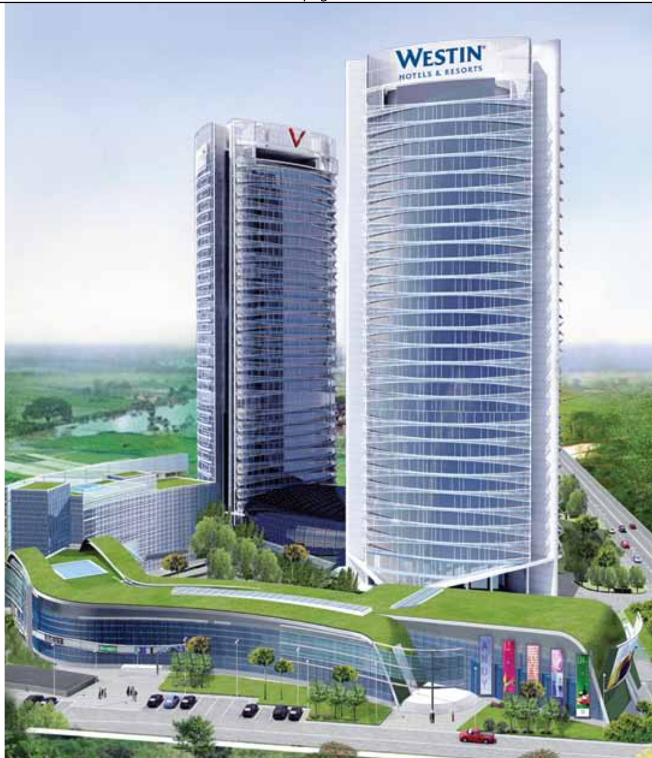
5 STAR HOTEL & THE V, KOLKATA | HOSPITALITY AND MIXED USE