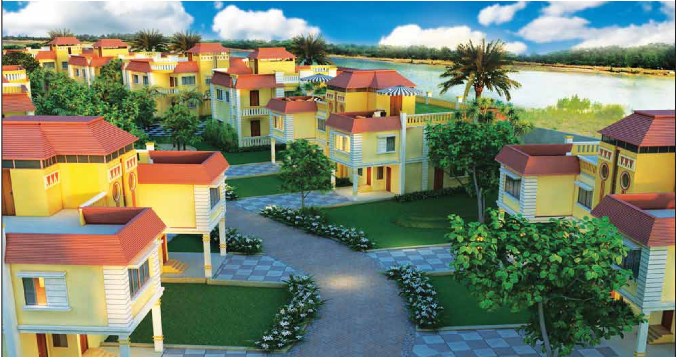
SHANTI SHRISTI, SANTINIKETAN | BUNGALOW ESTATE