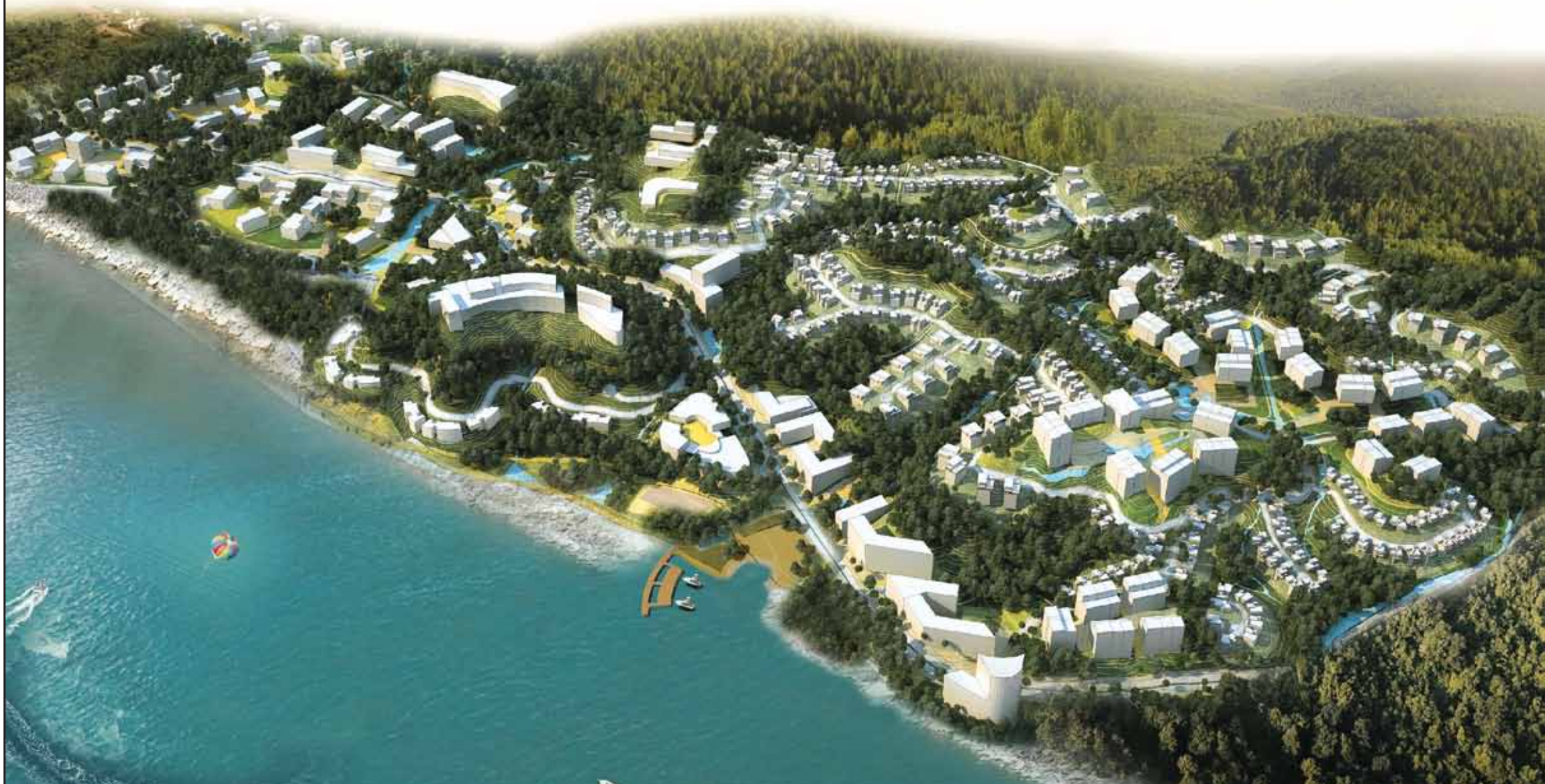
SHRISTINAGAR - GUWAHATI | INTEGRATED TOWNSHIP