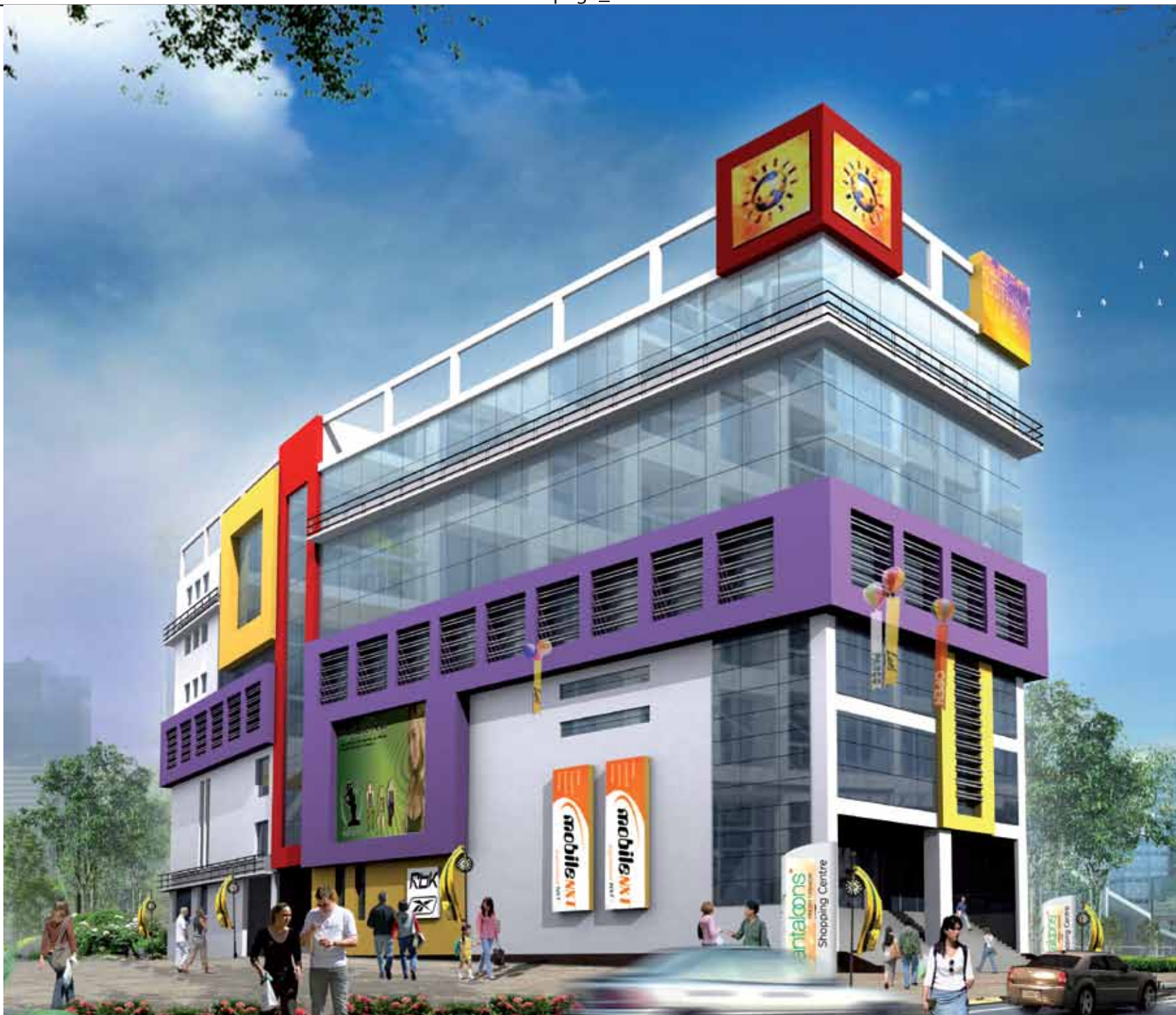
AITORMA AGARTALA SENTRUM | URBAN COMPLEX