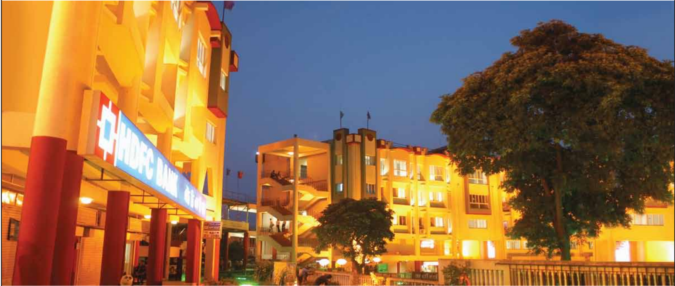
DURGAPUR CITY CENTRE | COMMERCIAL & RESIDENTIAL COMPLEX WITH RETAIL MALL