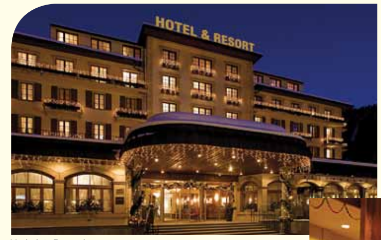
Hotel & Resort